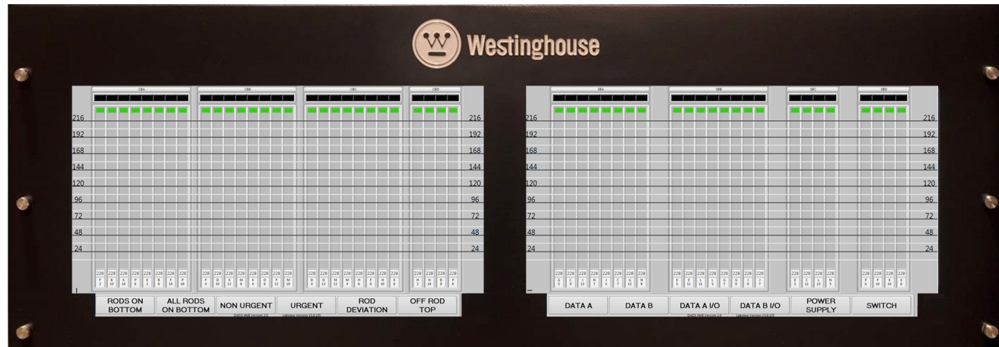
DRPI Advanced Display System (DADS)