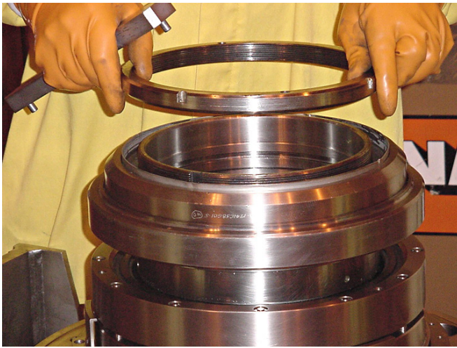
Seal being rebuilt