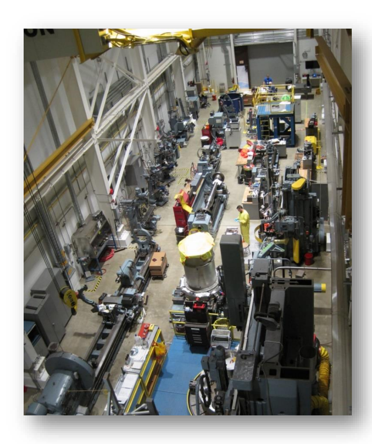
Waltz Mill Machine Shop