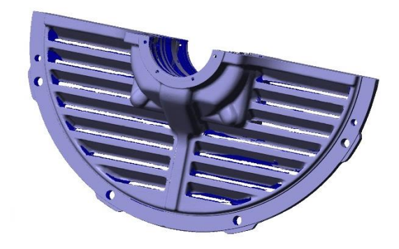
Lower Bracket for Split Sleeve Horizontal Motor