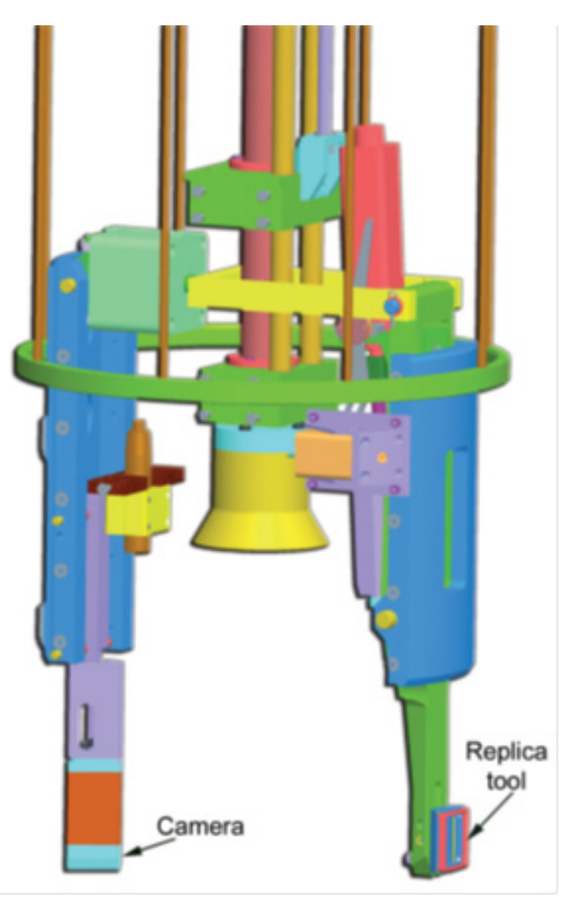
Manipulator for pump housing inspection

Westinghouse has developed a process and tools for the measurement of wear that includes the visual inspection and measurement of the wear indication on the performed replicas. This is of great use when accessibility is a concern.