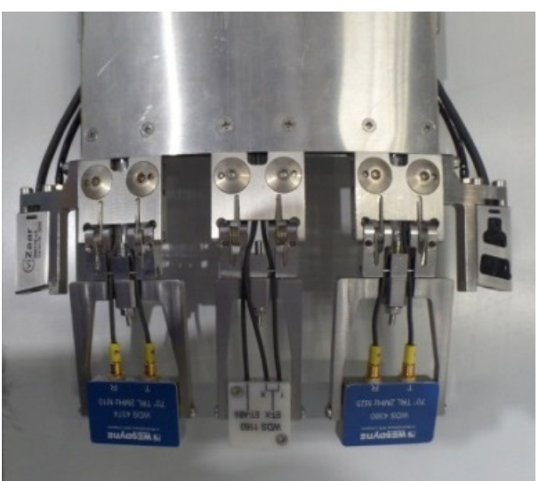
Probe head for 8 mm thick gap for boiler spine inspection CAD design and Actual probe head used

WESDYNE INTERNATIONAL is a leading worldwide supplier of nondestructive examination (NDE) solutions and products for all inspection needs, with a focus on the nuclear market. WESDYNE's expertise spans all aspects of remote and mechanized inspections – from analyzing problems and generating solutions to developing and manufacturing inspection systems and deploying teams of highly skilled inspections personnel with state-of-the-art equipment. WESDYNE's inspection capabilities cover all key NDE areas such as ultrasonic, visual, eddy current, magnetic particle, dye penetrant and X-ray. With locations in Sweden, Germany and the United States, WESDYNE is uniquely qualified to provide safe, customized and cost-effective NDE solutions for customers around the world.