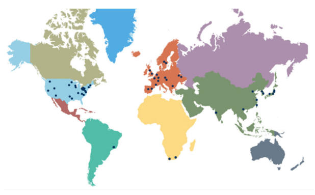
Local support locations