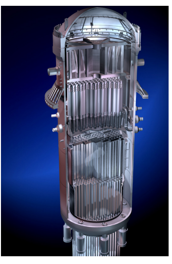
ABB III - BWR3000 plant