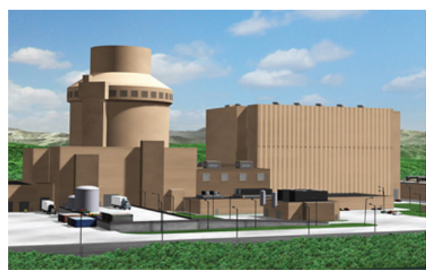
Westinghouse AP1000 plant

Over the last 25 years, WESDYNE has performed inspections at 194 different nuclear reactors worldwide including pressurized water reactors, boiling water reactors, advanced gas-cooled reactors, Russian design VVERs and RBMKs.