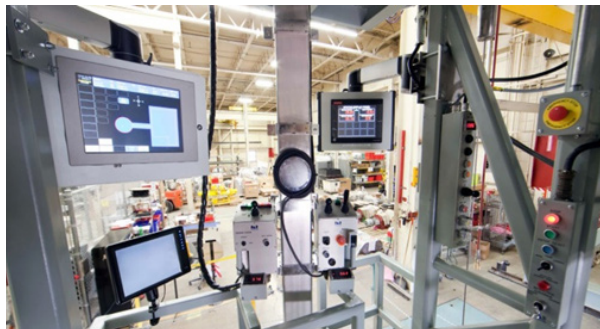
Model GR control system