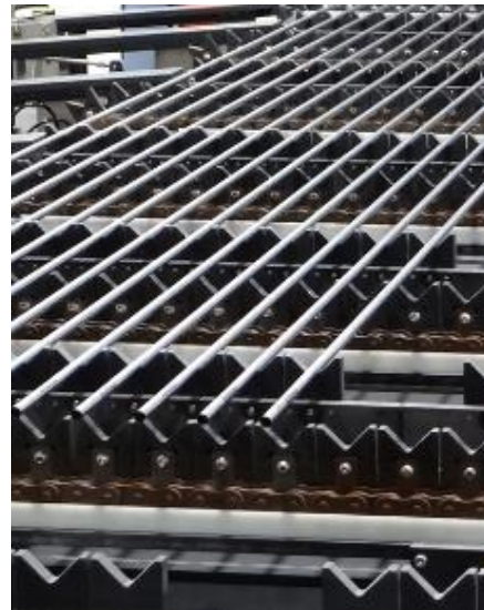
AXIOM fuel tubing on oxide coater