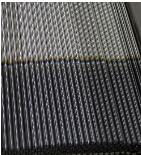
AXIOM fuel tubes

Westinghouse has successful global experience with AXIOM lead test rods (LTR) and lead test assemblies (LTA) in Europe and in United States, with successful completion of production qualification. AXIOM cladding fuel rods have been irradiated in reactors globally achieving burnup levels up to 75 GWd/MTU.