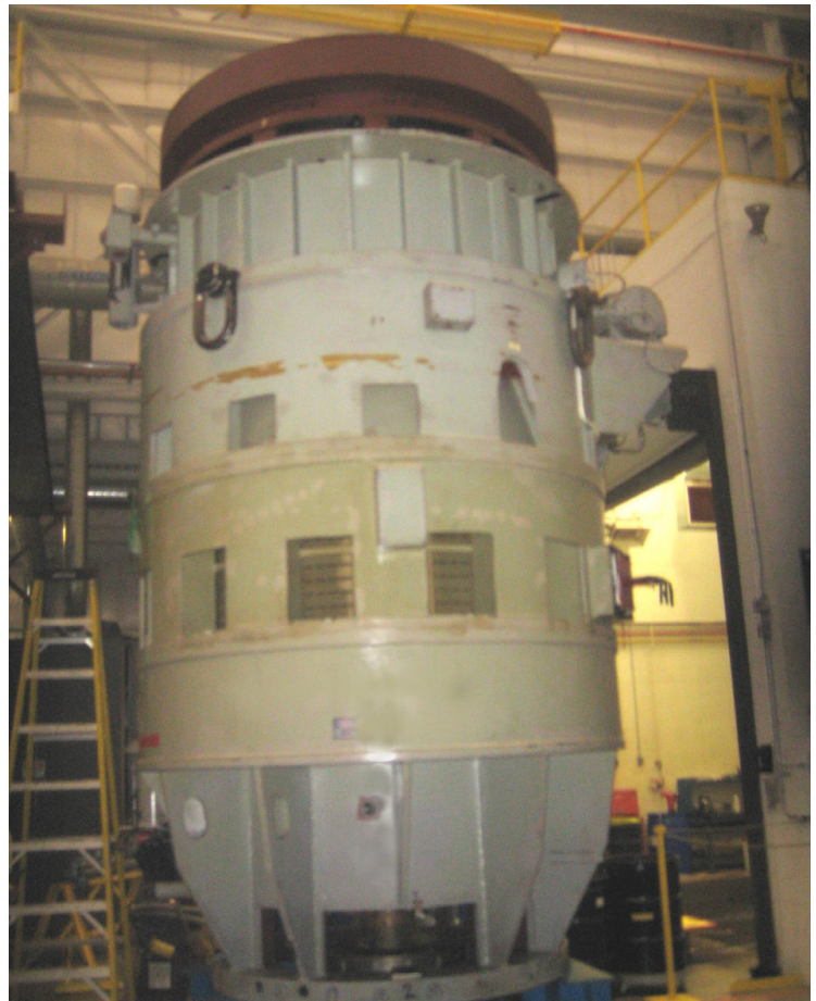
Westinghouse RCP motor