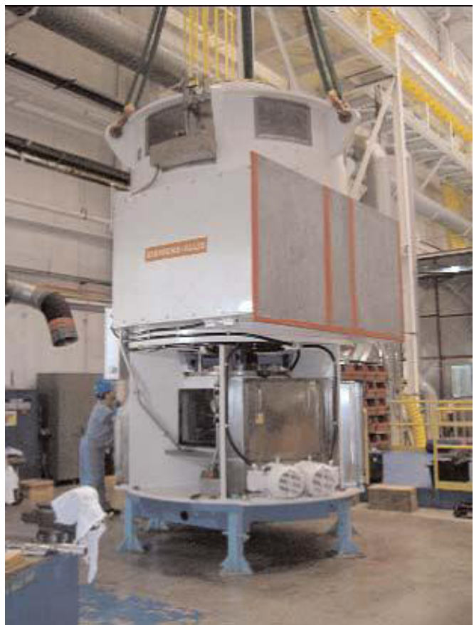
Siemens-Allis RCP motor