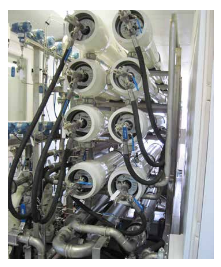
Reverse osmosis filtration system