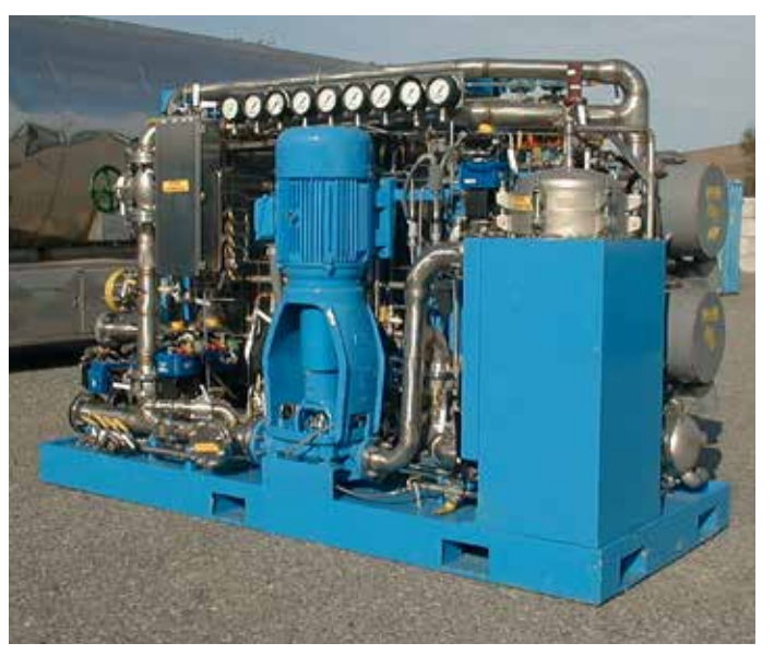
Filter/Ion exchange skid