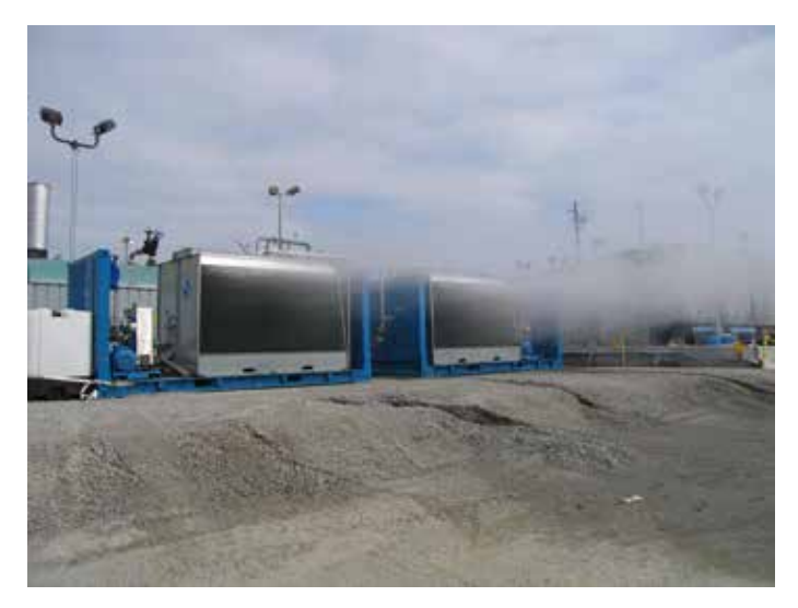
Portable cooling towers

This unique system consists of portable equipment skids that are designed to be installed quickly and easily in convenient locations. The modular design of the pumps, filters and heat exchangers permits safe and reliable operation with redundant capability.