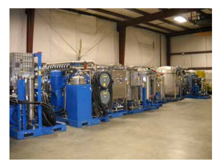
Off the shelf, field-ready equipment