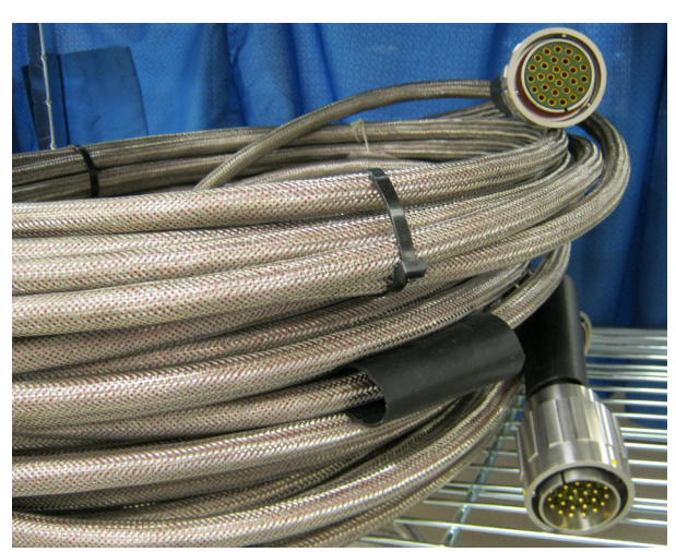
DRPI head cable