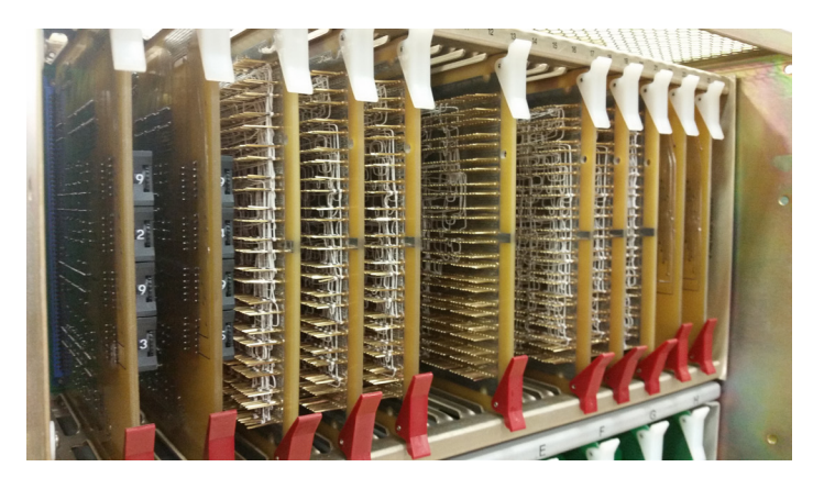
Westinghouse provides quality products that meet nuclear industry and IPC standards

AP1000 is a registered trademark of Westinghouse Electric Company LLC, its affiliates and/or its subsidiaries in the United States of America and may be registered in other countries throughout the world. All rights reserved. Unauthorized use is strictly prohibited.