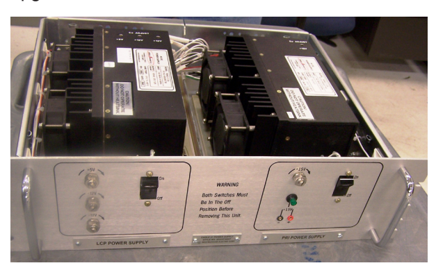
Eagle power supply assembly

At the Westinghouse Nuclear Parts Operations (NPO) Electro-Mechanical Assembly (EMA) and Instrumentation and Control (I&C) shop in New Stanton, Pennsylvania (USA), Electrical Operations provides electrical and I&C replacement parts and new systems for Westinghouse and Combustion Engineering designed operating plants, along with assembly and testing of prototype and production systems for new plant and upgrade projects. NPO technicians also provide field service groups with components, tooling, equipment and technician assistance during customer outages and plant upgrade services.